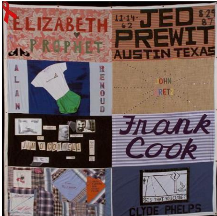
NAMES Project AIDS Memorial Quilt Block # 95

Leader -3: Hello. My name is _____, and I am in the City of _____ in the State of _____. Scroll to the next page to see the panel names on Block # 95.